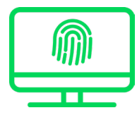
Evidential Review & CCTV Viewing